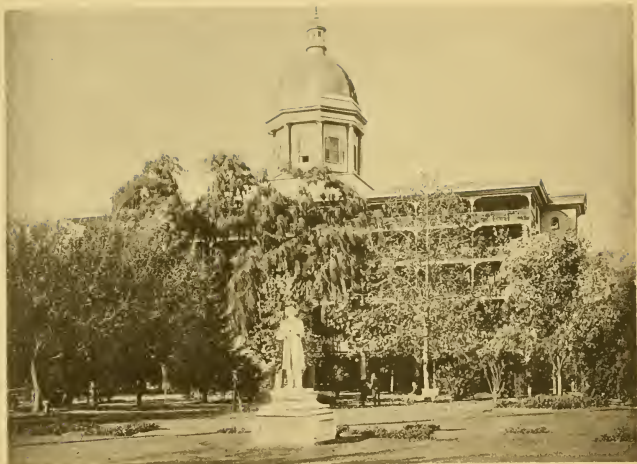
NATIONAL SOLDIERS' HOME — NEAR OLD POINT.